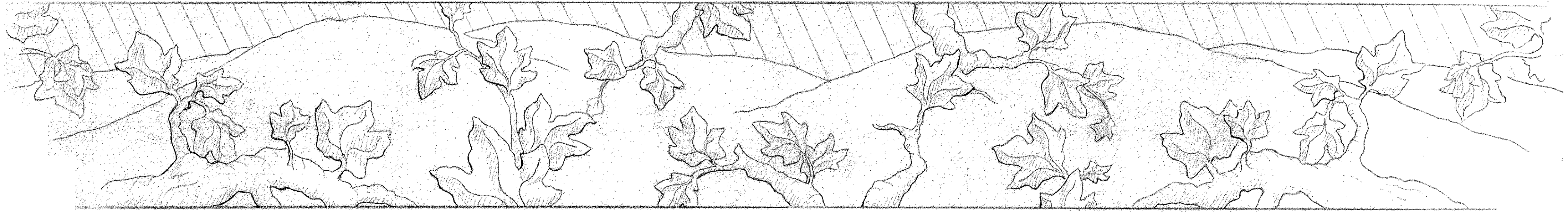
DETAIL OF GRILLE BELOW